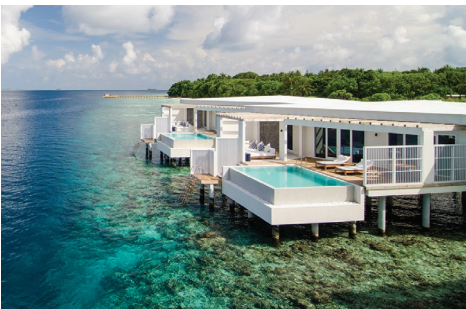
Ocean Reef Houses | 1 bedroom | 23 units | 250sqm