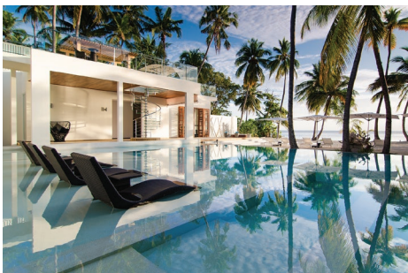
The Amilla Estate | 6 bedrooms | 1 unit | 2,500sqm