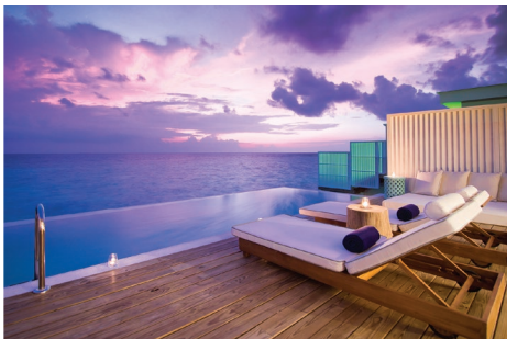
Lagoon Houses | 1 bedroom | 10 units | 200sqm