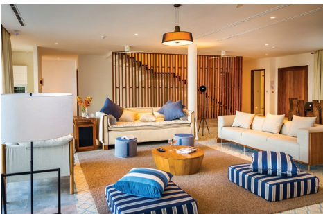
Beach Residences | 4 bedrooms | 6 units | 1,500sqm