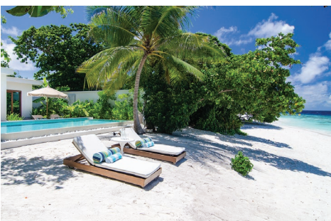
Beach Houses | 1 bedroom | 6 units | 450sqm