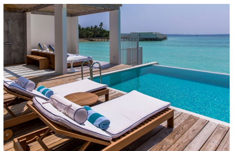
Ocean Lagoon Houses | 1 bedroom | 9 units | 230sqm