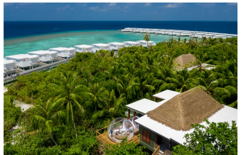
Skyhouses | 1 or 2 bedroom | 5 units | 220sqm